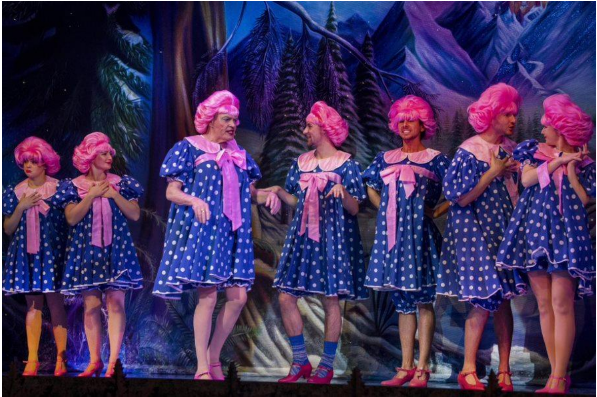
Back at the palace, the team confront Dragonella with the help of two superheroes – Mr and Mrs Incredible!